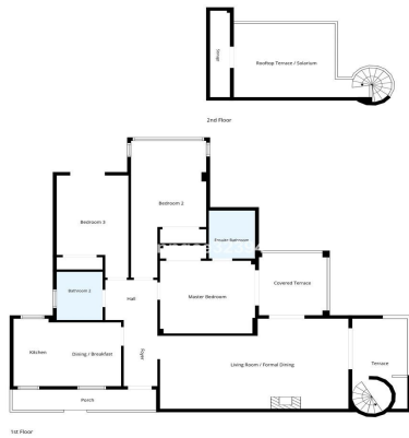
Floor Plan Created By Cubicase App. Measurements Deemed Highly Reliable But Not Guaranteed.