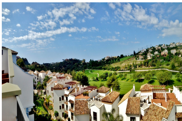
90 sq. mtrs. of rooftop solarium