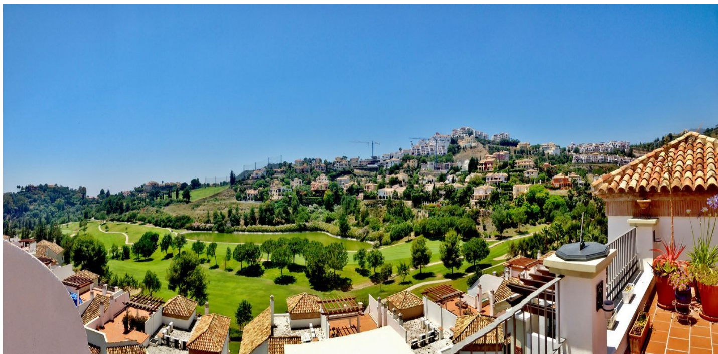
Lower terrace dining area

Referencia: R5207851 Dormitorios: 3 Baños: 2 Construido: 108m 2 Terraza: 94m 2