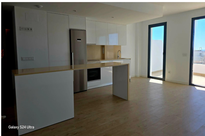
Galaxy S24 Ultra