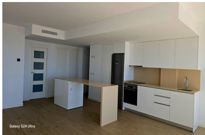
Galaxy S24 Ultra