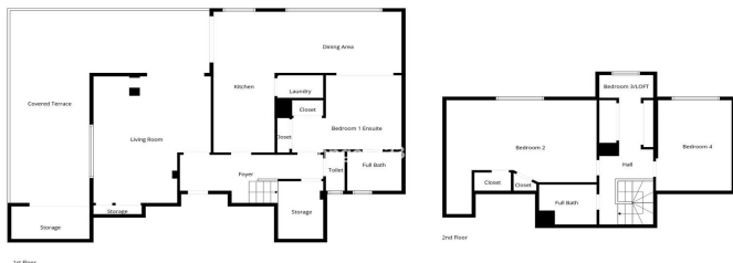
Floor Plan Created By Cubicase App. Measurements Deemed Highly Reliable But Not Guaranteed.