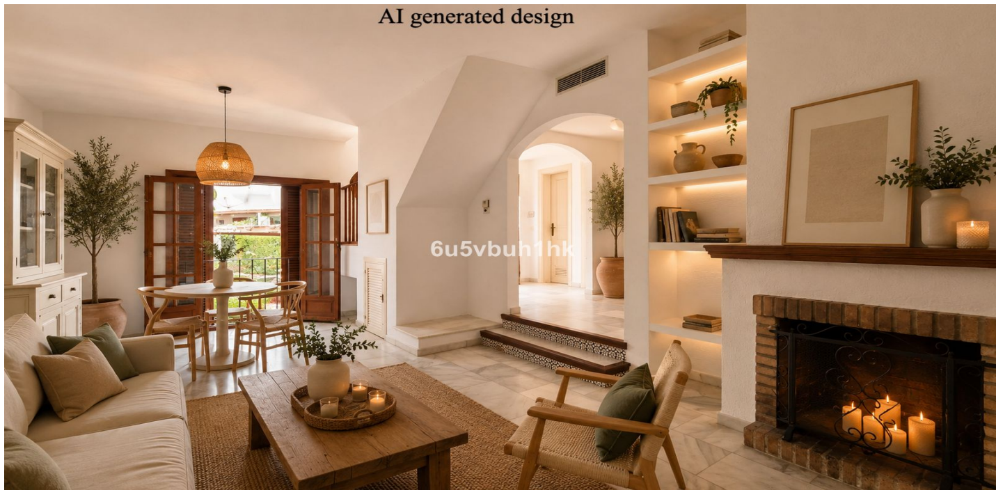
AI generated design

Referenz: R5022052 Schlafzimmer: 2 Badezimmer: 2 Garten: 96m 2 Terrasse: 10m 2